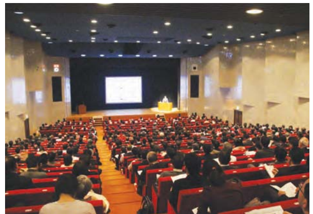
Special training: Roles of IP Departments in Protecting Trade Secrets

The lecturers and instructors include IP personnel from our member companies, lawyers, patent attorneys, and professors. Every year, about 15,000 people participate in our training courses and programs, which are available to personnel from both our regular and associate members (some are intended only for companies, however).