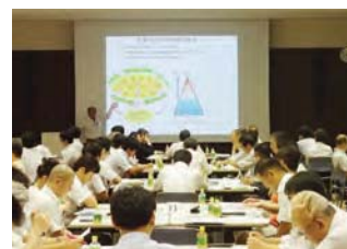
Industrial group meeting

Every regular member can attend four to five meetings of the relevant industrial group for JIPA's Kanto Division or Kansai Division: the Metal/Machinery Group; the Electrical/Electronics Group; the Chemical Group; the Trading Company Group; or the Construction Group. An industrial group holds seminars and provides other opportunities for regular members to study issues concerning their industry.