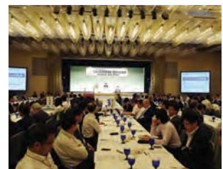
Ordinary general meeting of members