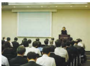
Regional division meeting

Regular members whose offices or business sites are located in the Tokai region or the Chugoku, Shikoku, and Kyushu regions can participate in the three meetings of the district council that are held every year.