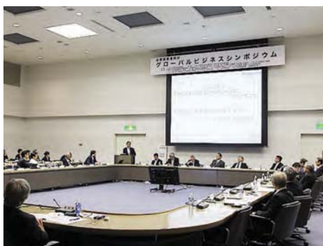
Symposium for business owners

Projects are launched to carry out activities related to proposing policies and other activities dealing with more than one IP field. At present, JIPA has seven ongoing projects: the Project on Strategy for Asian Countries; the Project on Corporate Cooperation between Japan and China; the Project on International Policy and Strategy; the Project on Symposiums; the Project on Cooperation with WIPO; the Project on the Revitalization of Intellectual Property; and the Project on Next-generation Content.